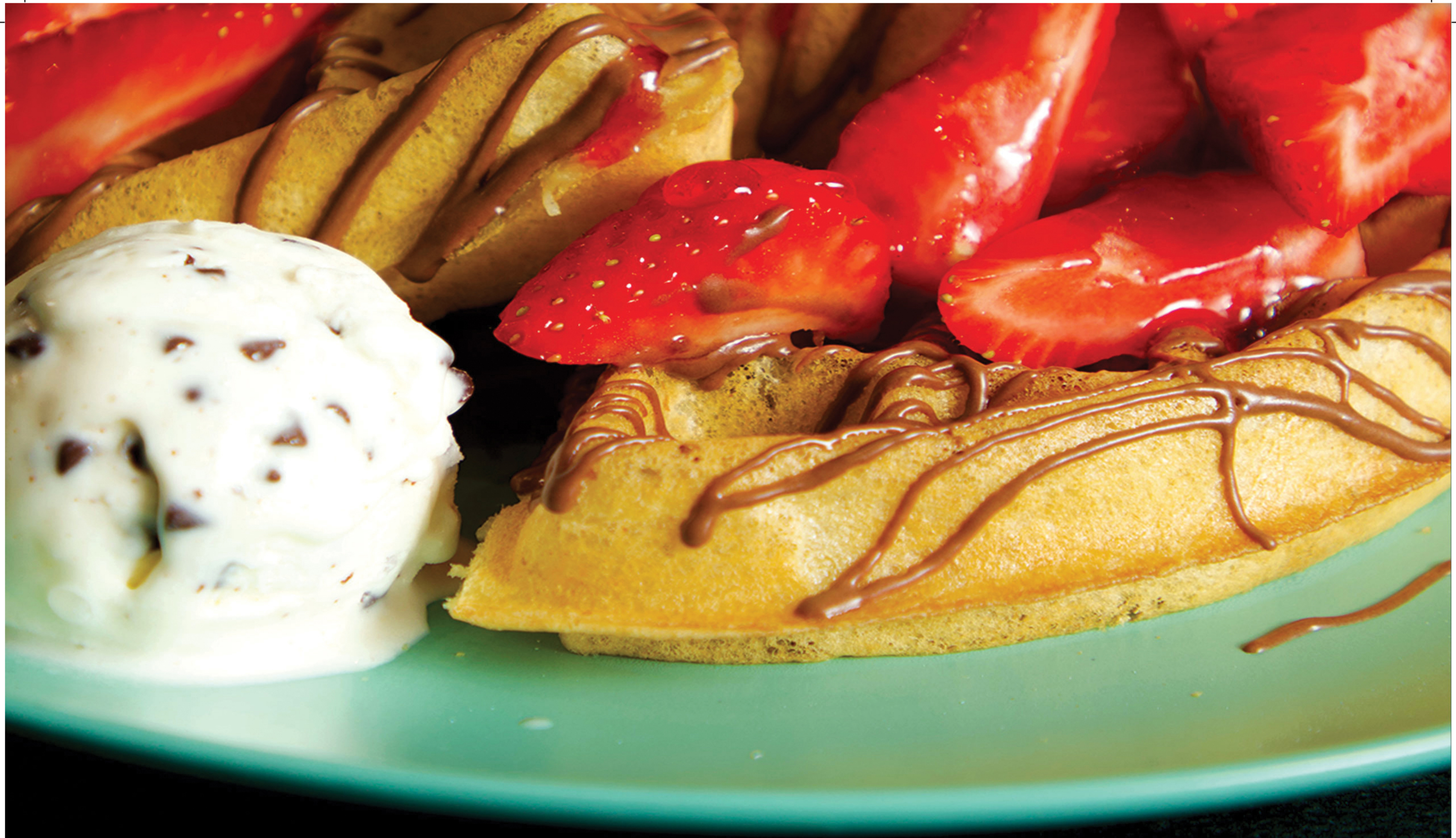
CHOCO BERRY WAFFLE